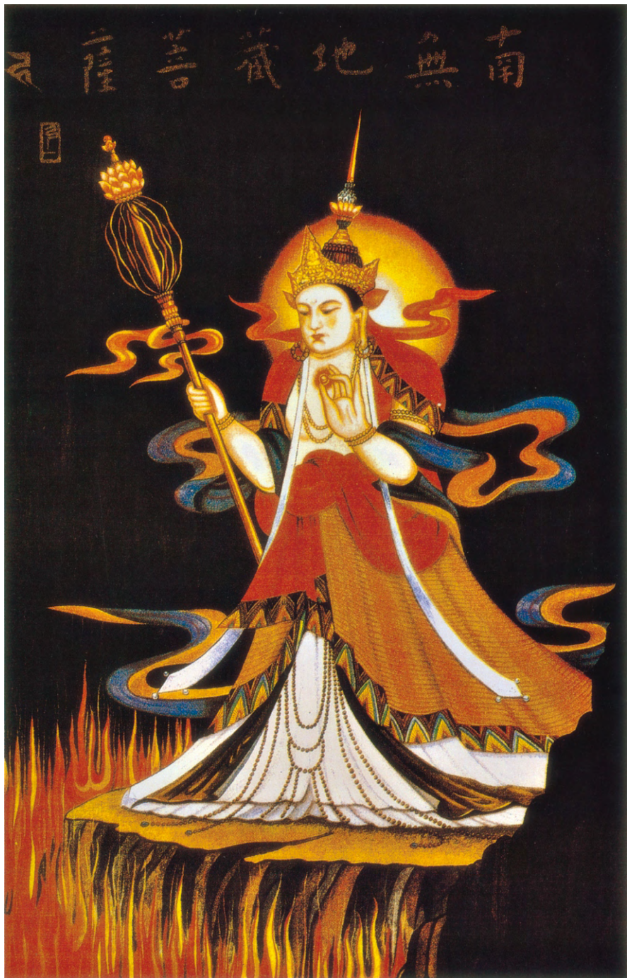
南無地藏菩薩 Namo Terra-Treasure Pusa